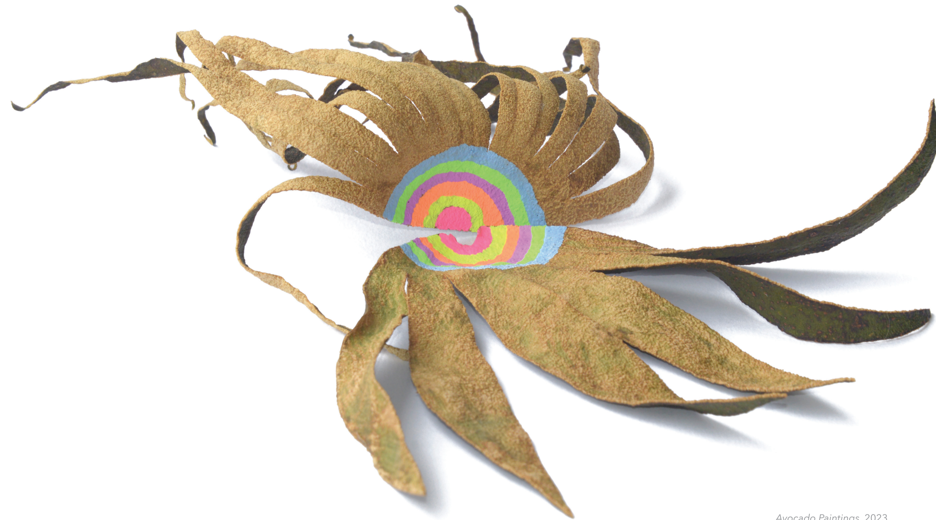
Avocado Paintings, 2023. avocado ( Persea americana ) 1