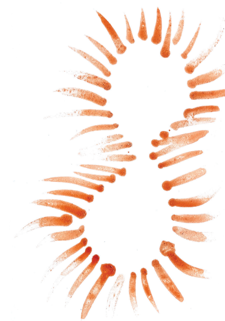
Amazonia II, 2023 urucum ( Bixa orellana ) 3