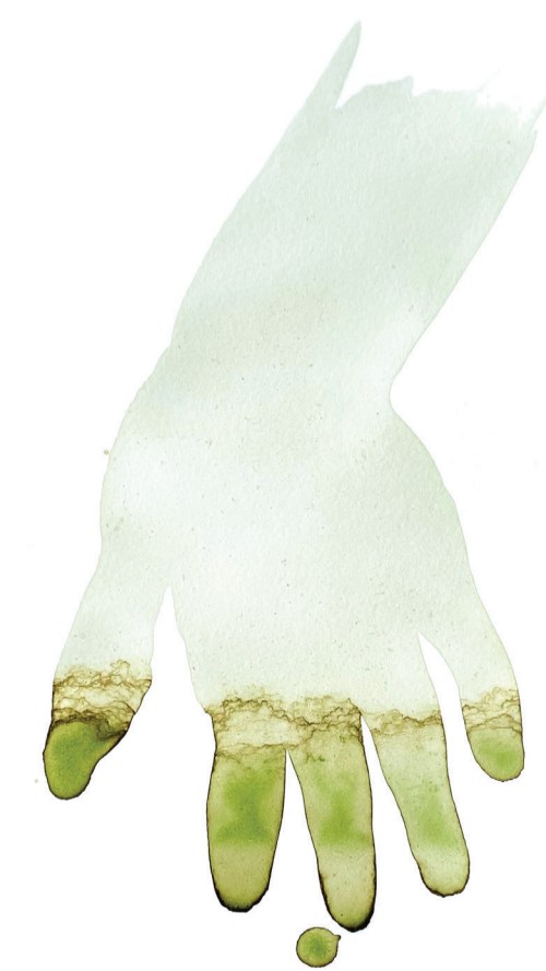
Amazonia I, 2023 jambú ( Acmella oleracea )