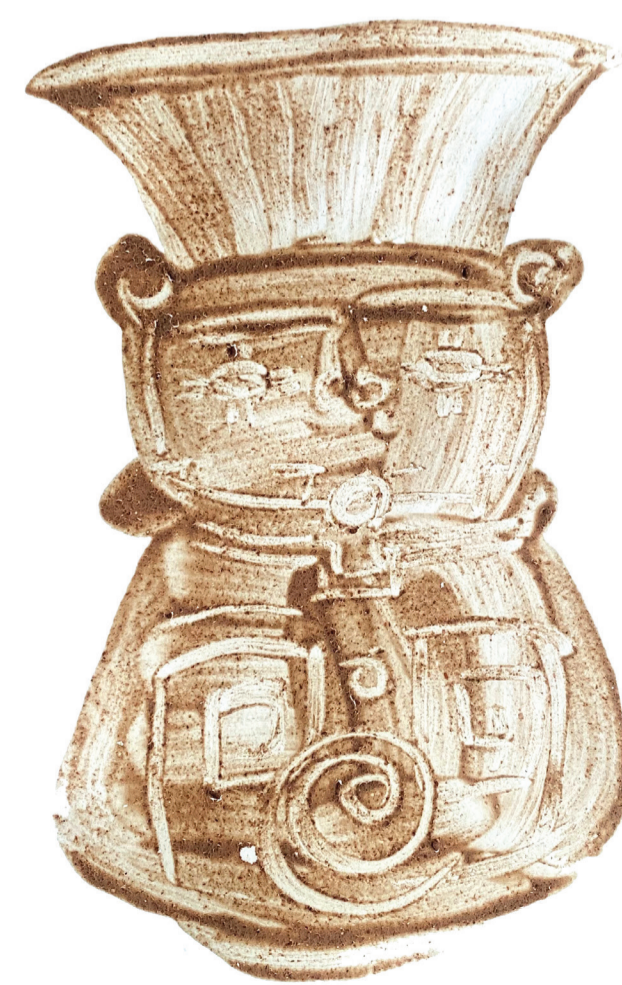
Amazonia I, 2023 bacaba / white açai ( Oenocarpus bacaba )