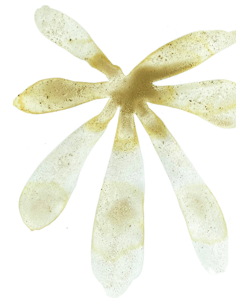
Amazonia I, 2023 maniva / cassava ( Manihot esculenta )