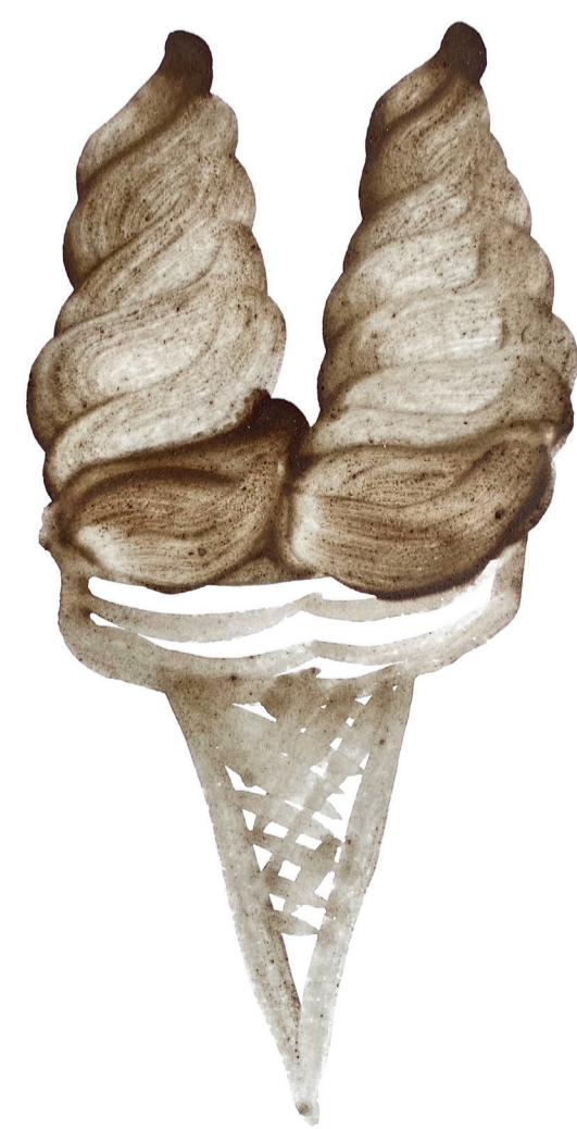
Amazonia I, 2023 açai fruit ( Euterpe oleracea )