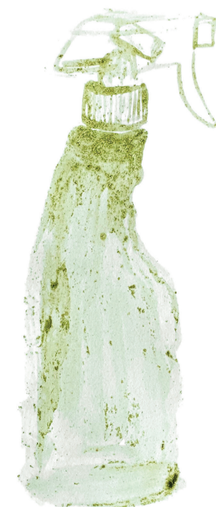
Amazonia I, 2023 caruru ( Talinum fruticosum ) 2